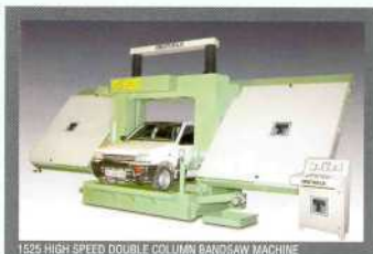
1525 HIGH SPEED DOUBLE COLUMN BANDSAW MACHINE