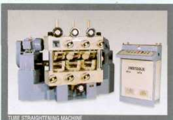
TUBE STRAIGHTENING MACHINE