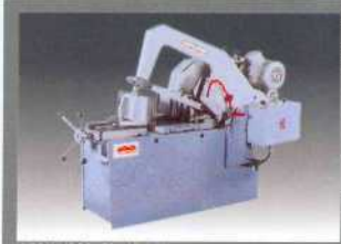
HYDRAULIC POWER HACKSAW