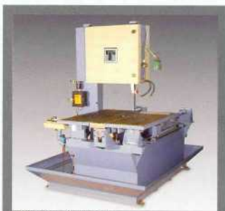
VERTICAL BANDSAW MACHINE