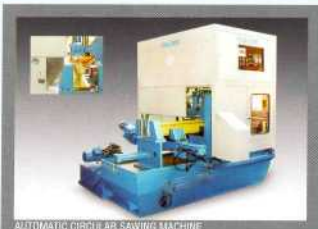
AUTOMATIC CIRCULAR SAWING MACHINE