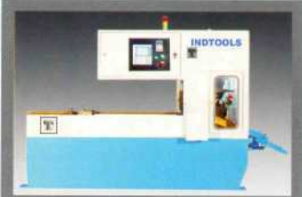
HIGH SPEED CIRCULAR SAWING MACHINE