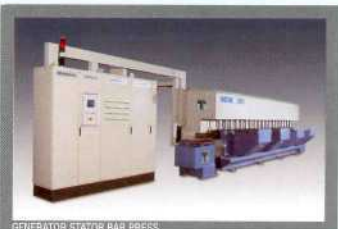
GENERATOR STATOR BAR PRESS