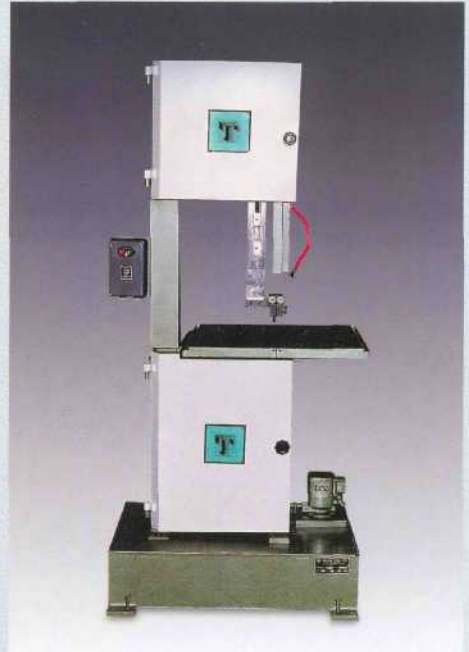
INDORE - 100 V2 VERTICAL BANDSAW